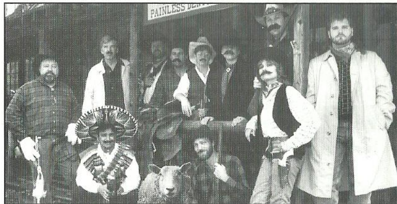
SCREW LOOSE AMUSEMENTS