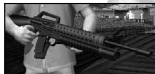
Machine Gun: You know the drill-point,shoot,destroy.