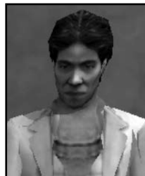
DIAZ BROS: Enter the bloodbath!