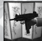
Sub-Machine Gun: Low power and low accuracy are made up for with sheer volume.