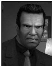
GASPAR: The Haza.