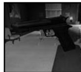
Pistol: Don't leave home without it.