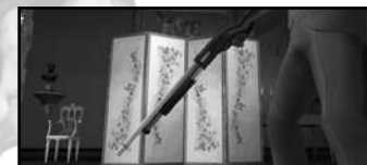
Shotgun: Vicious at short range, this is a great close-quarters weapon.