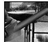
Chainsaw: A little off the top, please!