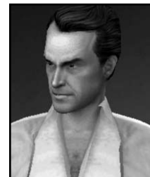
SOSA: I told you never to mess with me, Tony!