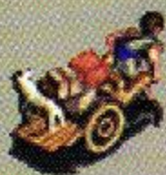
Immigrant or Emigrant