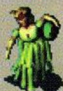
Market buyer or seller