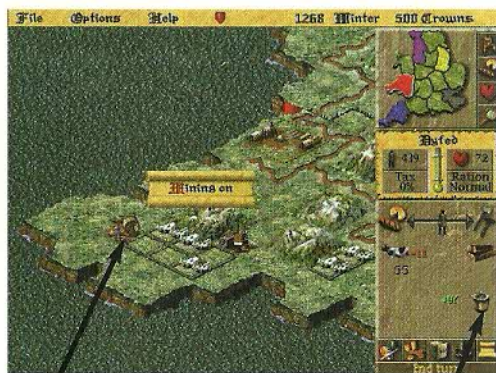
an iron mine

Find the industrial sites in your county (quarry, lumber mill, mine, blacksmith). Click on them to switch them on or off. The portion of your labor force that you have allocated to industry will be divided among those you have switched on. Notice the production symbols appear and disappear on the control panel as you switch industries on and off. At the start of a game, you should concentrate on a single industry, if any.